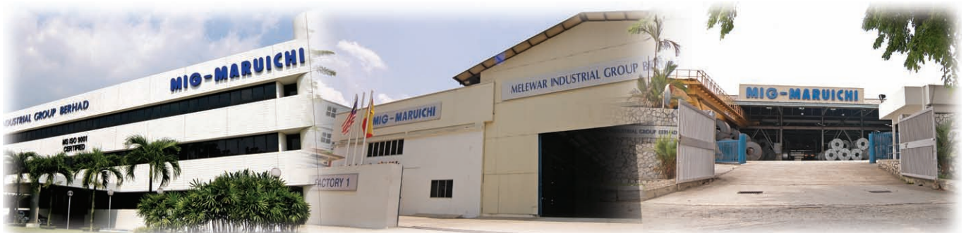
SHAH ALAM FACTORY OFFICE