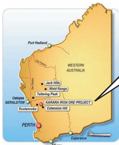
GINDALBIE METALS LTD.