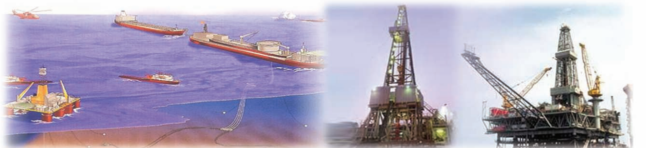
Oil and gas field development