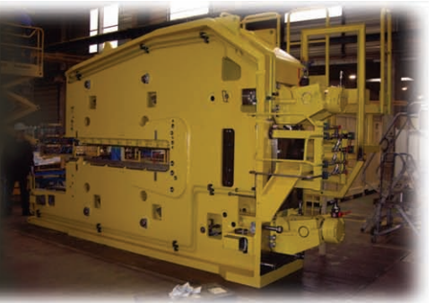
Part of welder