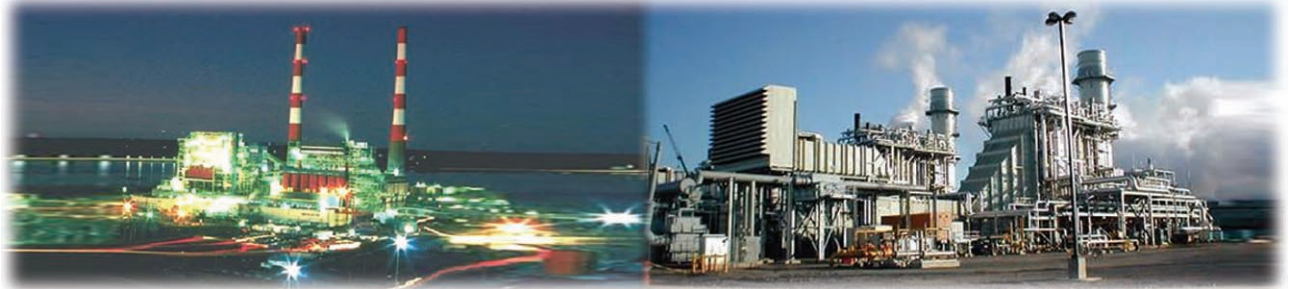
Similar cogeneration plant