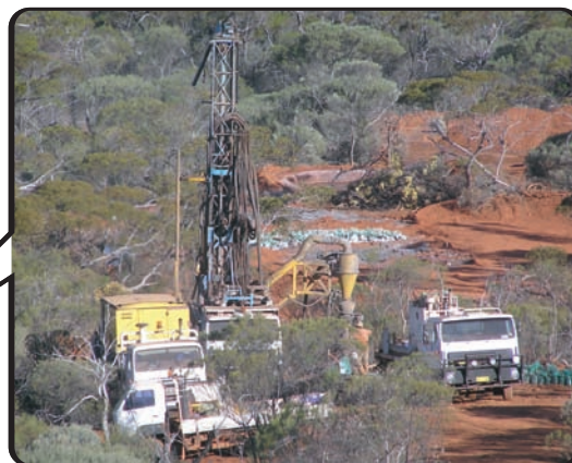
KARARA IRON ORE PROJECT SITE